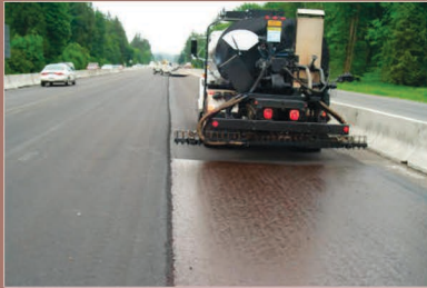
Good Tack Coat Coverage