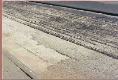
Bad Tack Coat Coverage