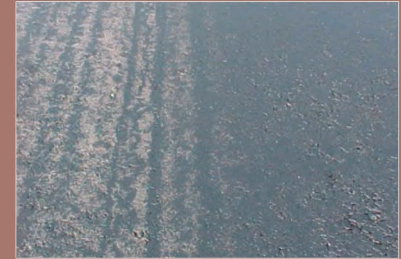
Poor Tack Coat vs Good Tack Coat